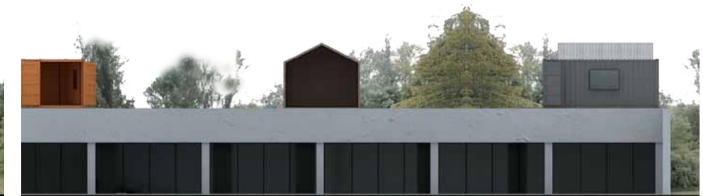
Фасада югозапад_камерна зала: 1/200 Elevation south-west_chamber hall : 1/200