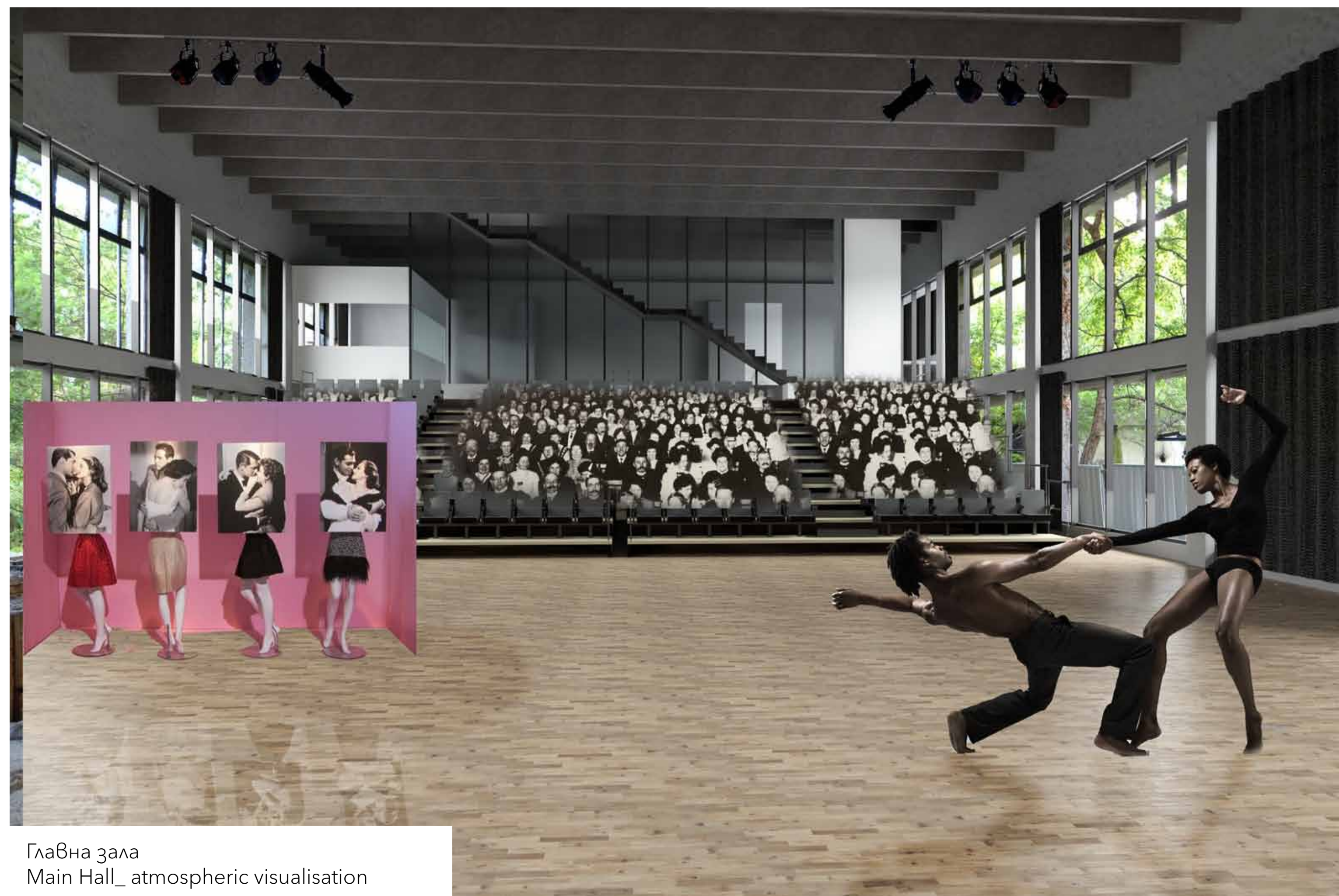
Главна зала Main Hall_atmospheric visualisation