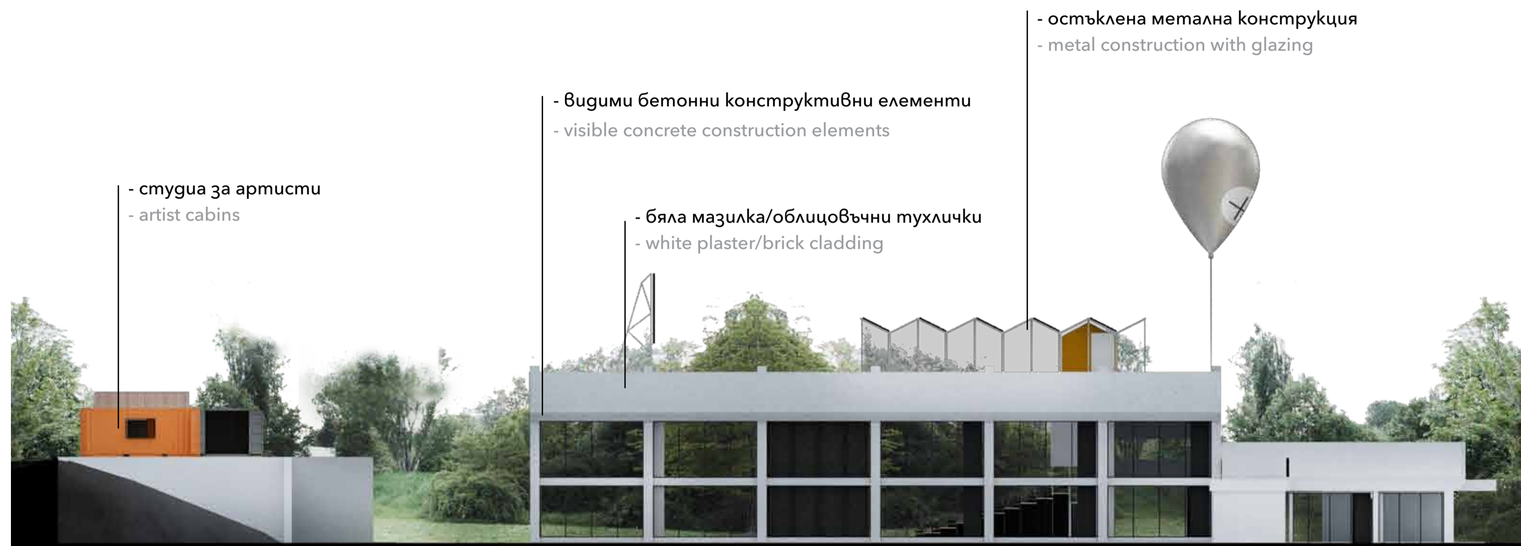
Фасада северозапад : 1/200 Elevation north-west : 1/200

Open architectural competition for reconstruction of the former Heating Plant of the National Palace of Culture ("Toplocentralata") into a Centre for contemporary art and culture