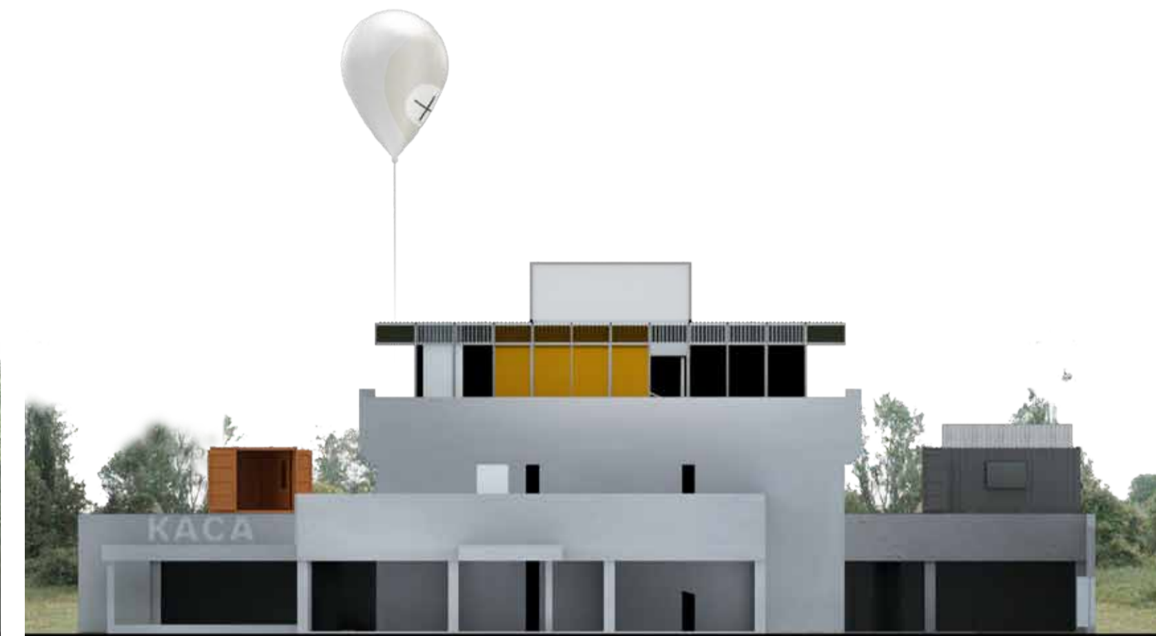
Фасада югозапад_главна зала: 1/200 Elevation south-west_main hall : 1/200